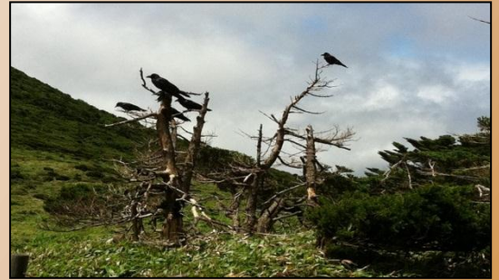
Abies Koreana on Halla Mountain in the danger of extinction due to climate change

• More occurrences of intense climatic events will provide harsh growing environments for highland agricultural crops and mountain ecosystems.