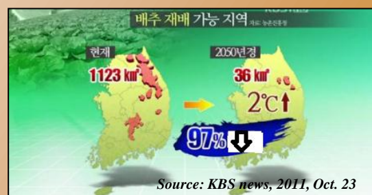
Projection of reduction in the optimal growing area of napa in a warmer climate