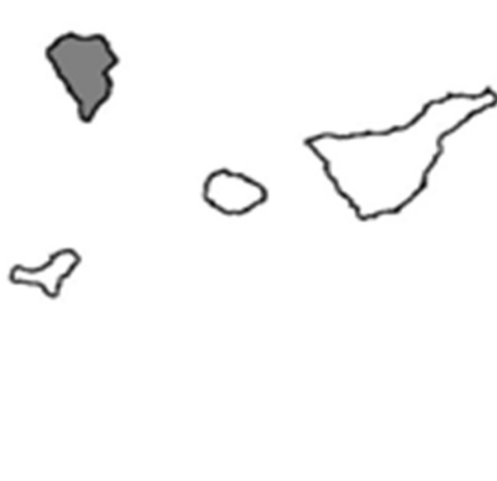
Aeonium davidbramwellii H.Y. LIU